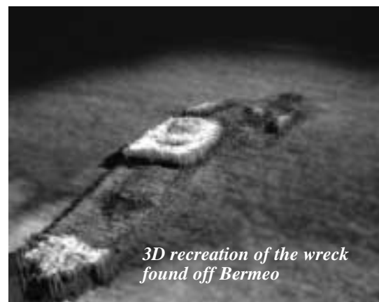
3D recreation of the wreck found off Bermeo

Specialists of the Azti Tecnalia Foundation, which belongs to the Basque Agriculture Department, identified the remains of the wreck last summer while they were preparing