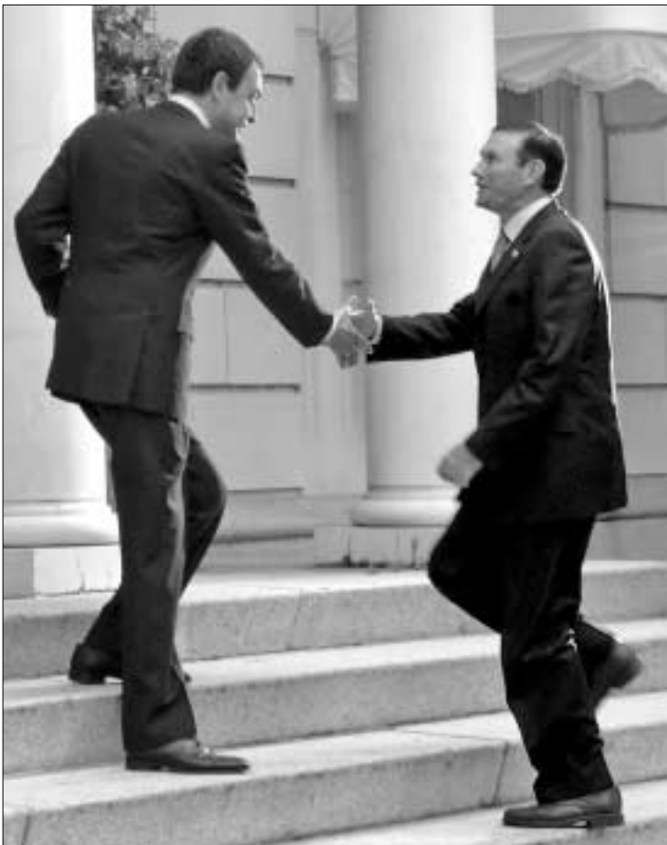
Zapatero and Ibarretxe shake hands at one of their last meetings.

Ibarretxe expresses his conviction that 2008 will be the year that marks end of the political deadlock