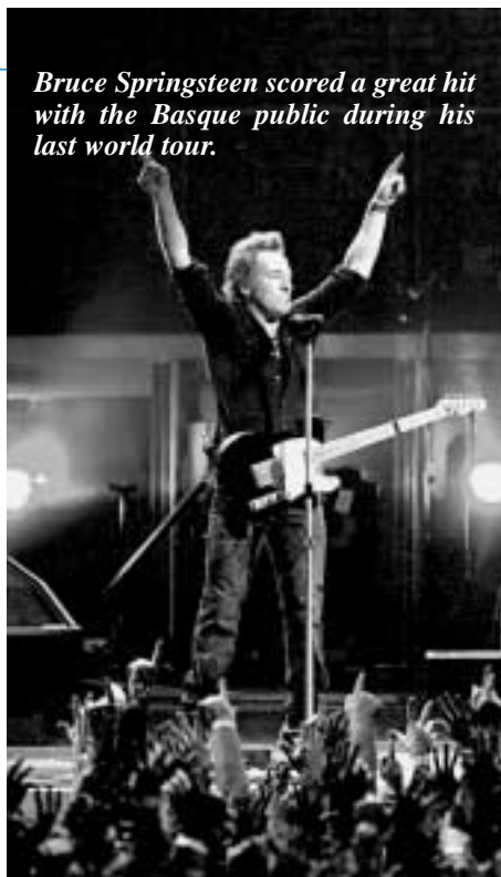
Bruce Springsteen scored a great hit with the Basque public during his last world tour.

The lower the age, the higher the percentage of music lovers, rising to 76% in the population